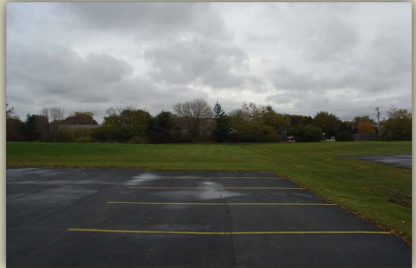
101 S. PIONEER RD. FOND DU LAC, WI