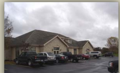
99 S. PIONEER RD.