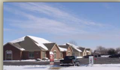
97 S. PIONEER RD.