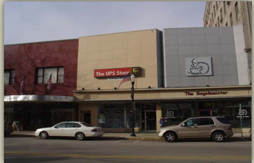
114 S. MAIN ST. FOND DU LAC, WI

Tenant will make space available for tours during operating hours by scheduling appointment with listing Broker in advance. Please call for details.