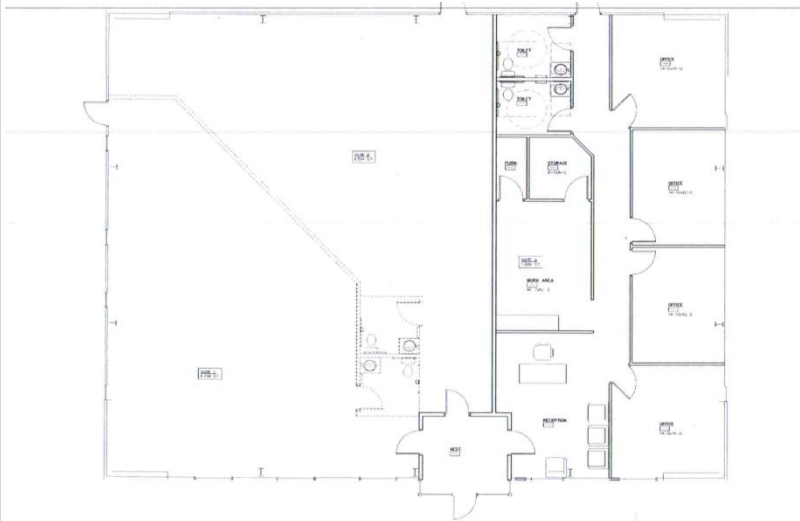
NORTH FLOOR PLAN