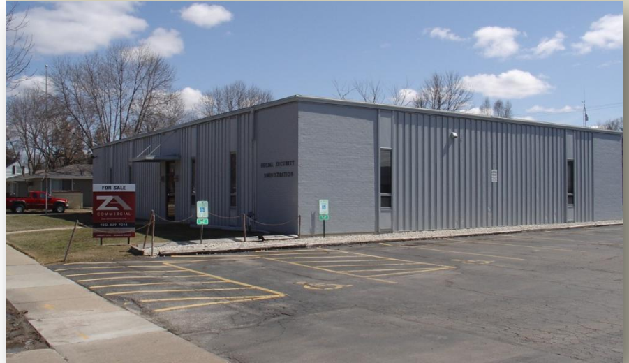
16 GUINDON BLVD. FOND DU LAC, WI