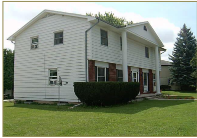
53 & 55 PIONEER PKWY.