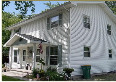
54 & 56 PIONEER PKWY.