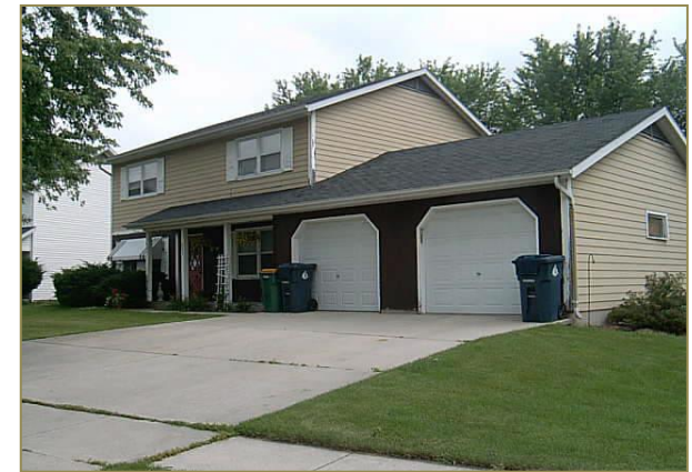
885 & 887 FOREST CR

Based on recommended pricing; likely to generate a 7-9% cap rate for investor. "General appearance of property is average or above." Investor likely to put value in area. and the good proximity to employment, schools, transportation & shopping. The market is active & normally there are no incentives typically being offered to buyers. Property values for comparable multi-family have been stable and within the ratio identified in the market conditions summary for the recent appraisals. Financing is readily available to qualified buyers.