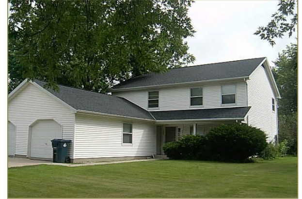
893 & 895 FOREST CR