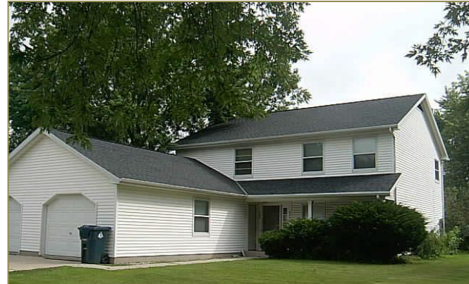
893 & 895 FOREST CR