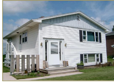
62 & 64 PIONEER PKWY.