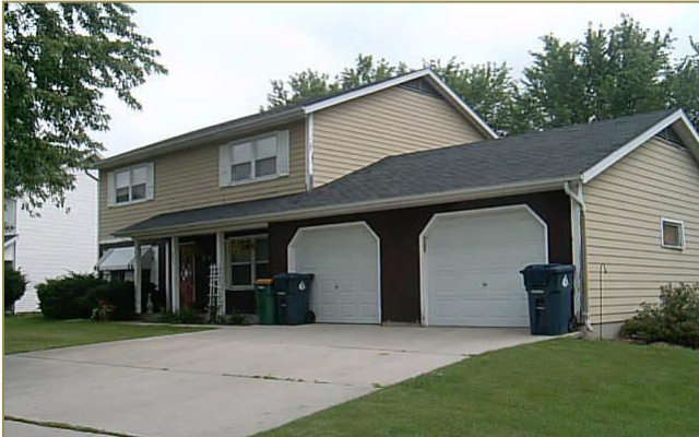
885 & 887 FOREST CR