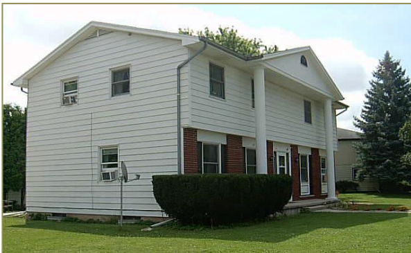
53 & 55 PIONEER PKWY.