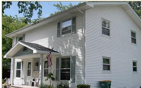
54 & 56 PIONEER PKWY.