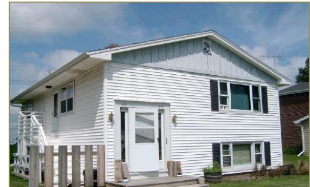
62 & 64 PIONEER PKWY.