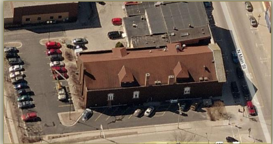
65 N. MAIN ST. FOND DU LAC, WI

Traffic in Local Corridor 2008 Street Address Approx. 8,000 daily Neighboring Corner Approx. 4,000 daily