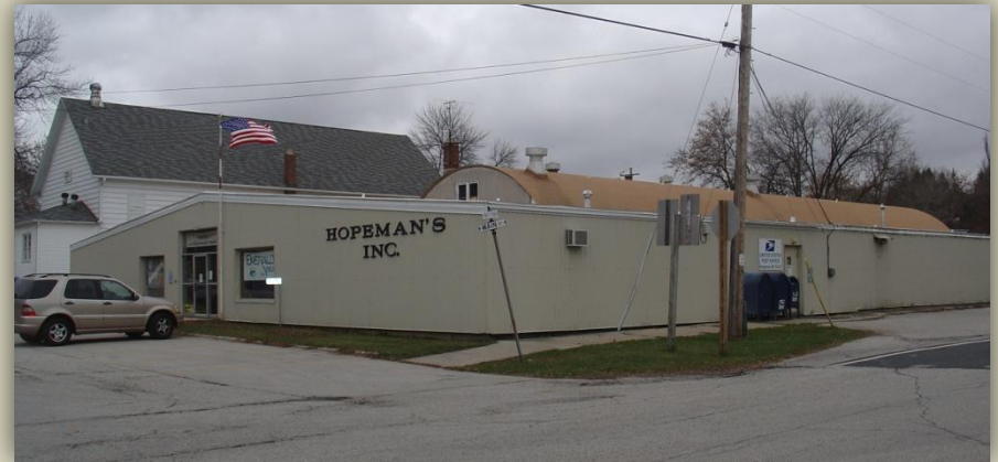
N 2750 MAIN STREET HINGHAM, WI